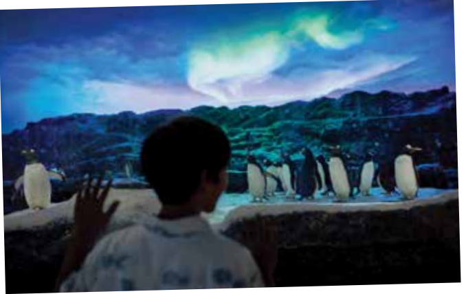
Ocean Network Express Penguin Cove